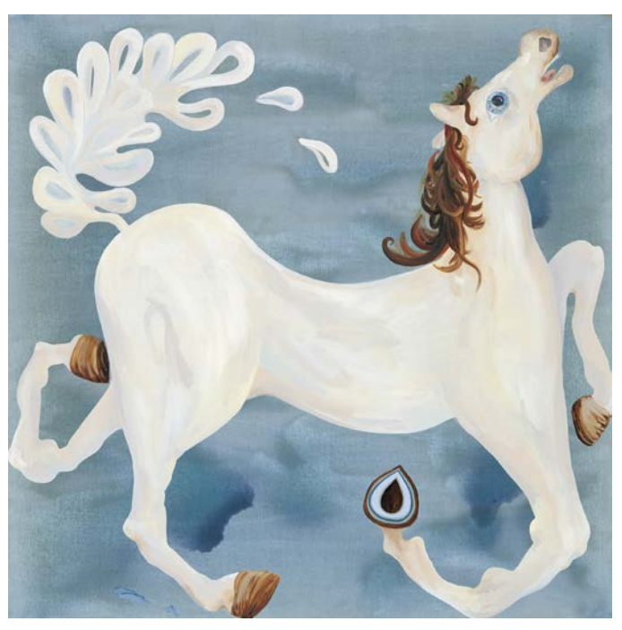
Laura Owens/Collection of Nina Moore

The paintings after 2005—a collage of grids in different scales colliding at different angles; a counterpoint of impasto freestyle painting, or silk-screened commercial imagery, or an expanse of text with the deadpan look of an old phone book. The compositions are retinal, assertive, like novel forms of candy seen in a glass jar. Their look is closer to greeting cards than to Franz Kline. This is strangely reassuring; they carry you along without protest, arbitrary, clownish, and weird.