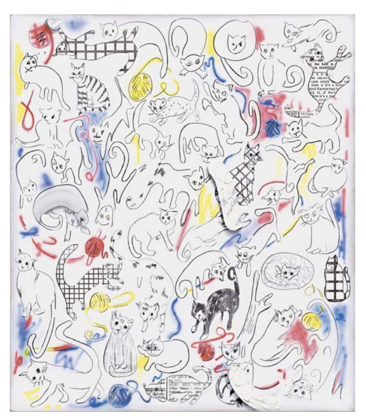
Laura Owens/Ringier Collection

Textiles, weaving, 2-D design—all are fullfledged high art now, and Owens has no problem letting herself be influenced by them. Another of her works from 2013 is an almost twelve-foot-tall painting with line drawings of cats playing with balls of yarn dispersed over its white ground (see illustration above). Some drawings are carefully executed and others more slapdash; some are in plaid, others in the grid patterns that Owens is so fond of. Here and there are touches of spray paint in raspberry, yellow, and blue. It's like a motif that one might find on a young girl's flannel pajamas, something a sophisticated sevenyear-old would find amusing and a bit arch. This is a painting that says: You want allover? OK, how about this? This is the way to be ambitious now. You don't always have to throw your Sunday punch.